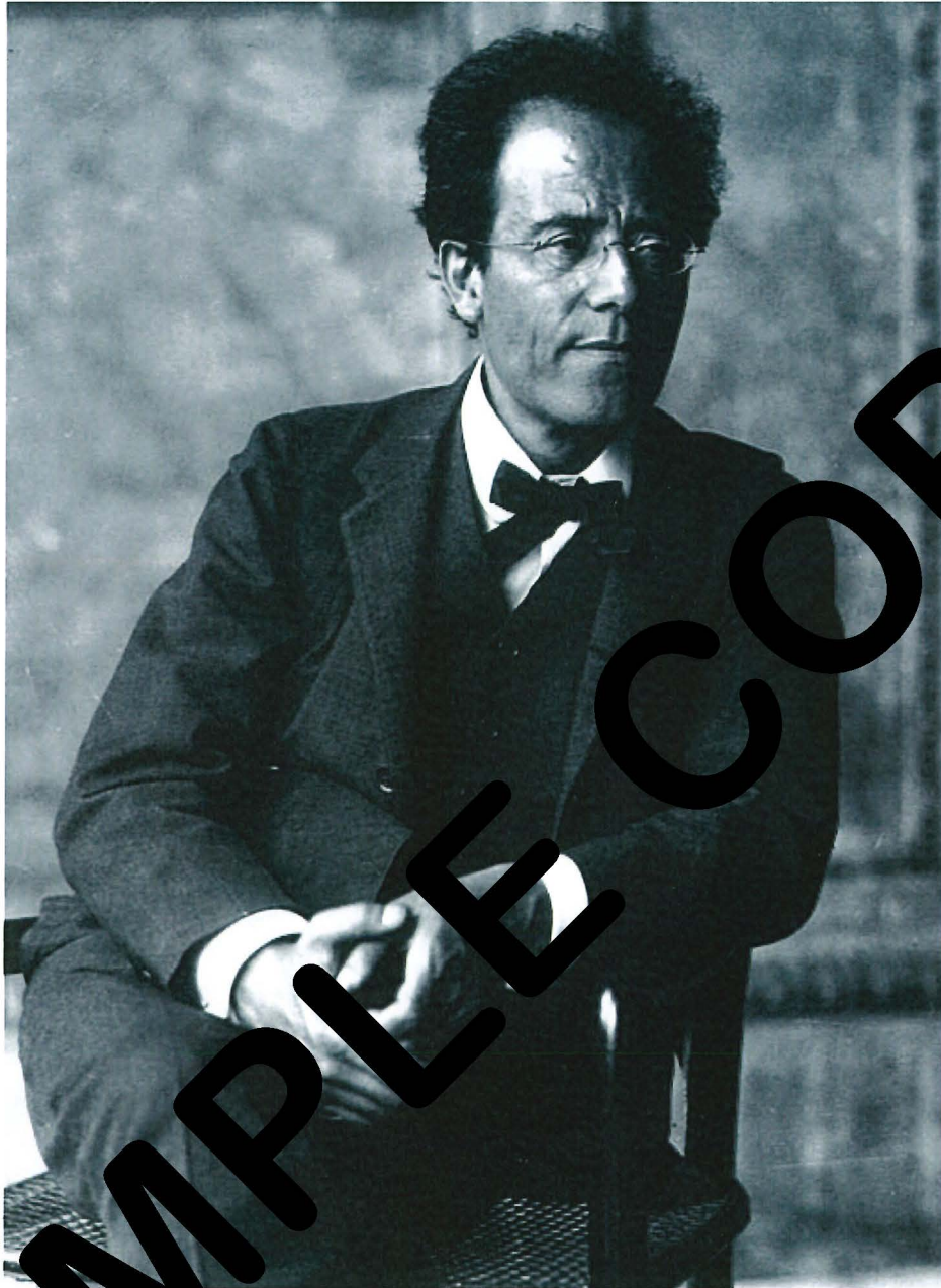
Gustav Mahler (1860-1911)